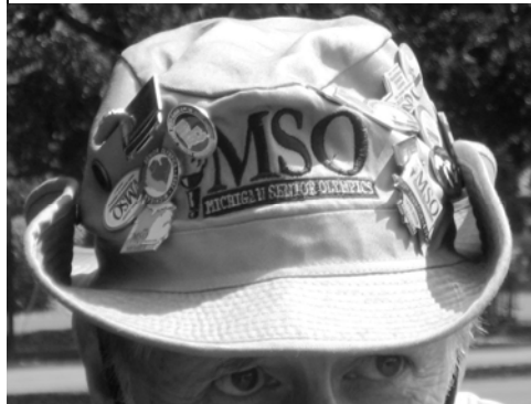
Do you know this athlete who is proudly displaying his MSO pins?