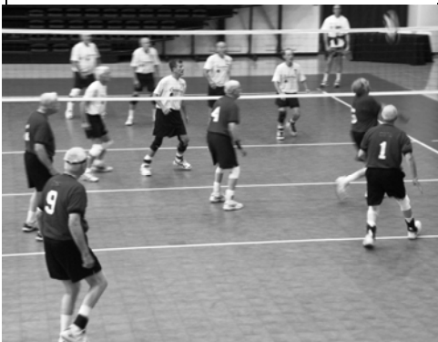
Michigan Cool 75 Men's 75+ volleyball team