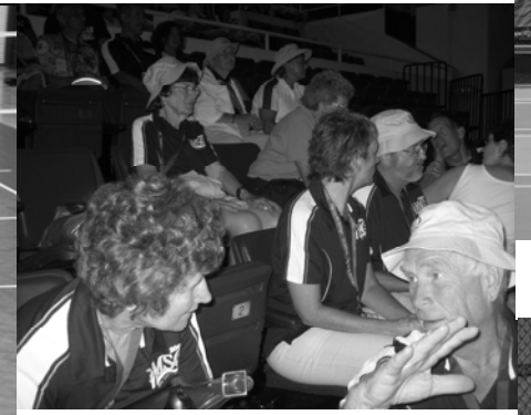
A good time was had by all at the Celebration of Athletes!