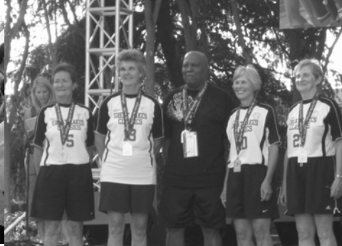
Great Lakes Classics, Silver medal in basket-